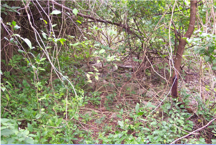
Appendix III: Figures 28 – Ruin of a pimento barbeques