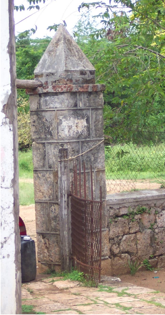
Appendix III: Figure 14 - The ornate cutstone fence columns