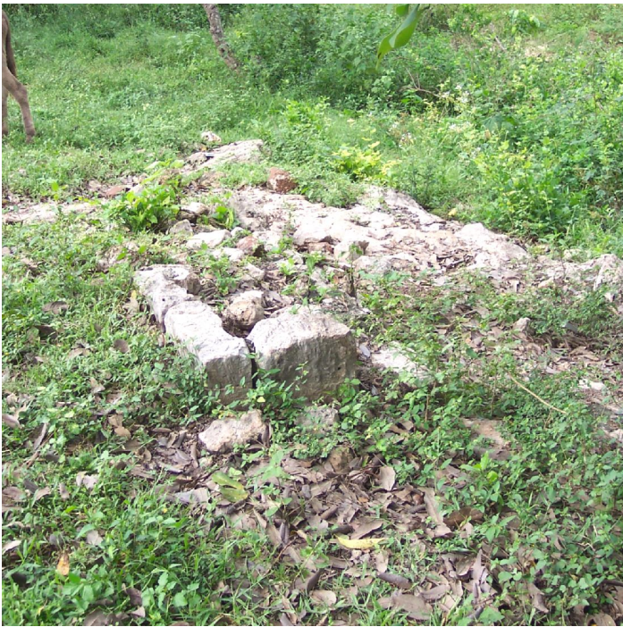
Appendix III: Figure 31 –The graves to the east of the house