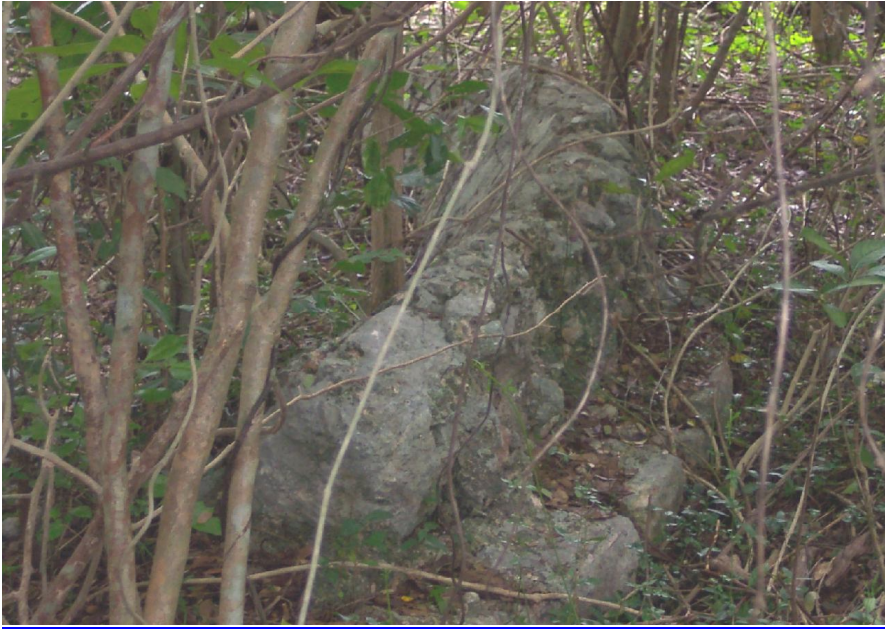
Appendix III: Figure 26 - Circular cutstone structure