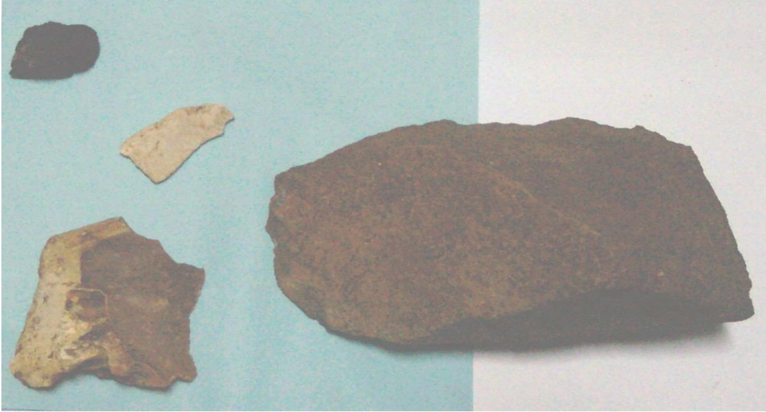
Figure: 1. Top left – charcoal from the circular structure; middle top – Taino stone blade (?); bottom left – Taino flint chopper; Taino stone axe.