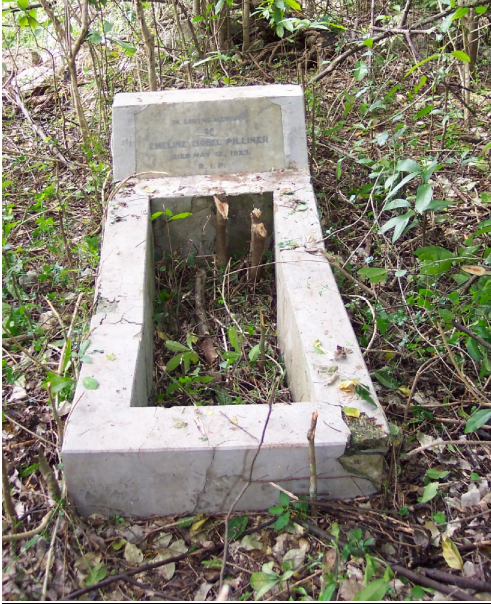
Appendix III: Figure 2 - The grave of Emiline Isobel Pilliner