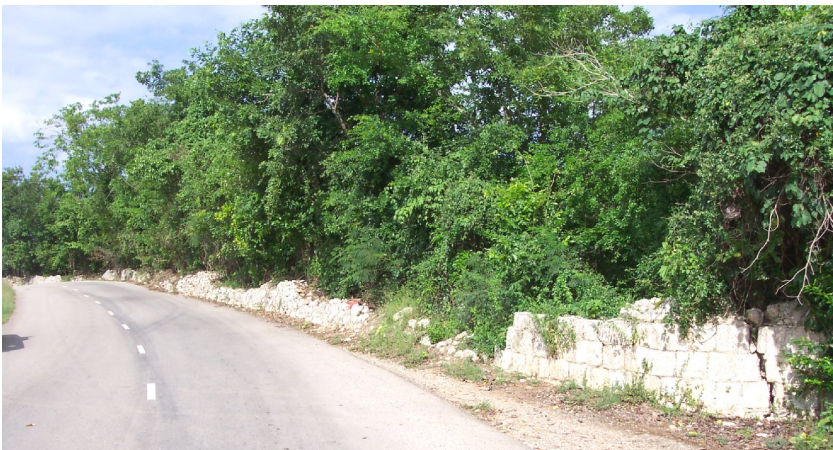
Appendix III: Figure 17 - The wall from the entrance north along the main road