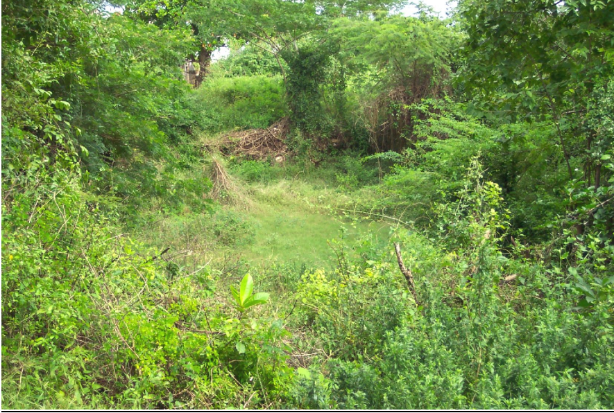
Appendix III: Figure 4 - The Pond