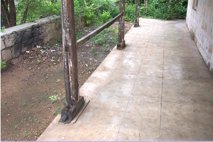
Appendix III: Figure 6 – The columns on the Planter’s house verandah