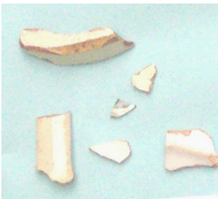
Figure 2: White ware shards from the first half of the 19th century. Top – base of a bowl; Bottom left – jug handle; Middle – body shards; Right - base of a plate.