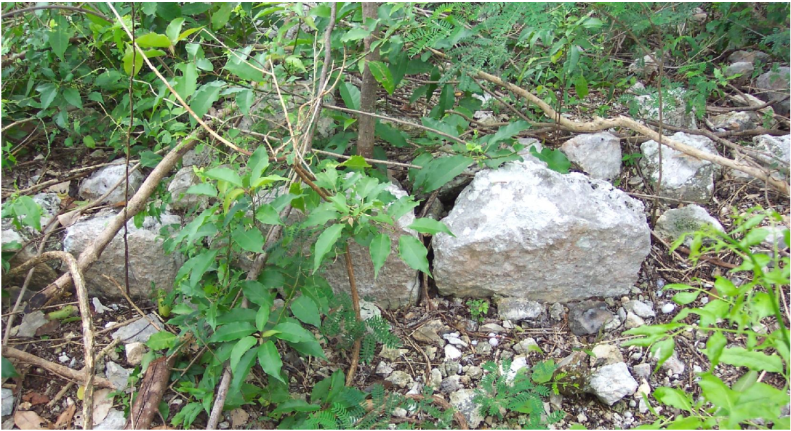
Appendix III: Figure 5 – Foundations of the sugar works