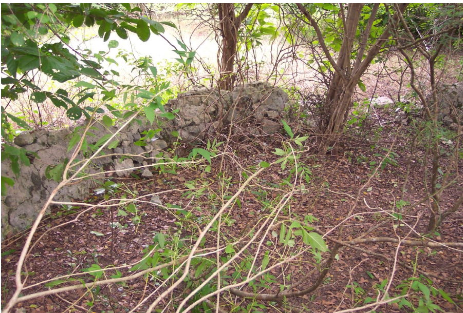
Appendix III: Figure 25 - Circular cutstone structure