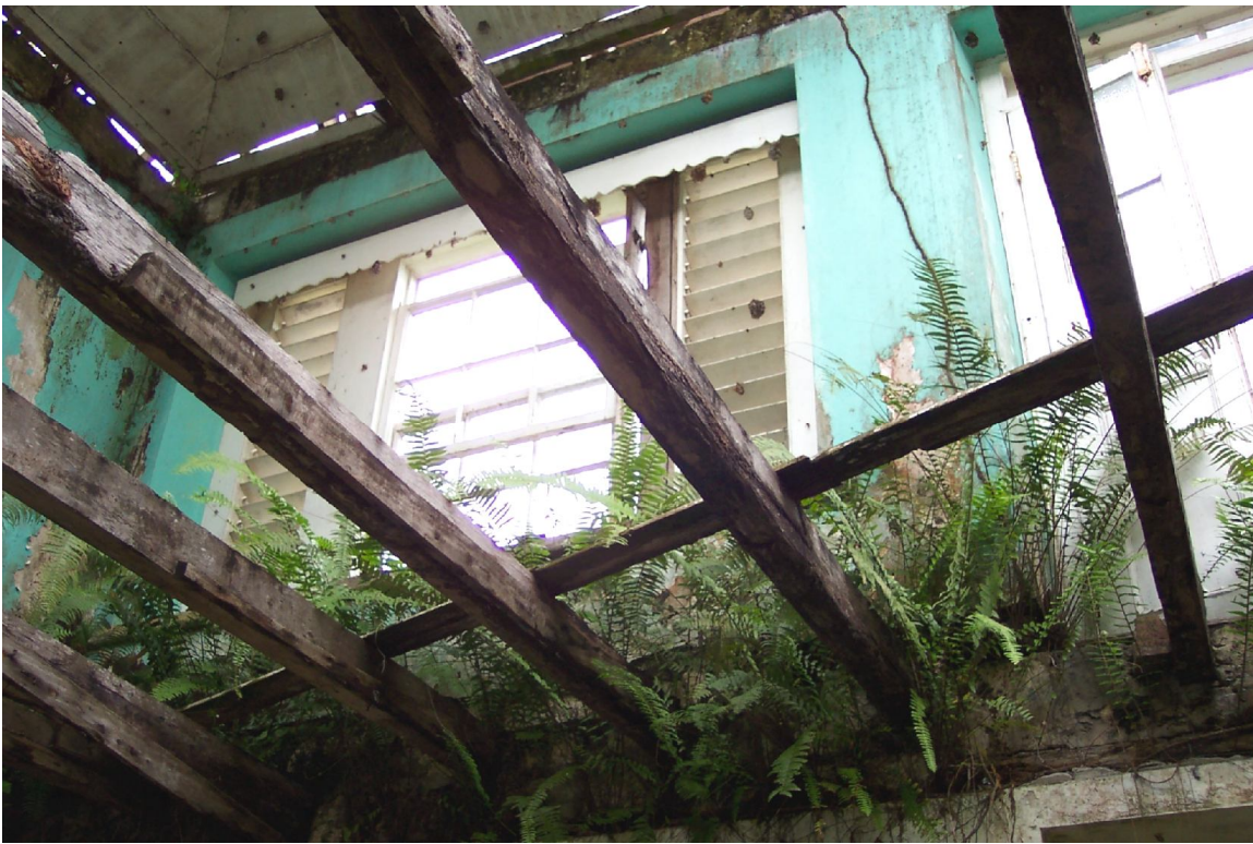
Appendix III: Figure 11 – The sash and jalousie windows of the planter's house