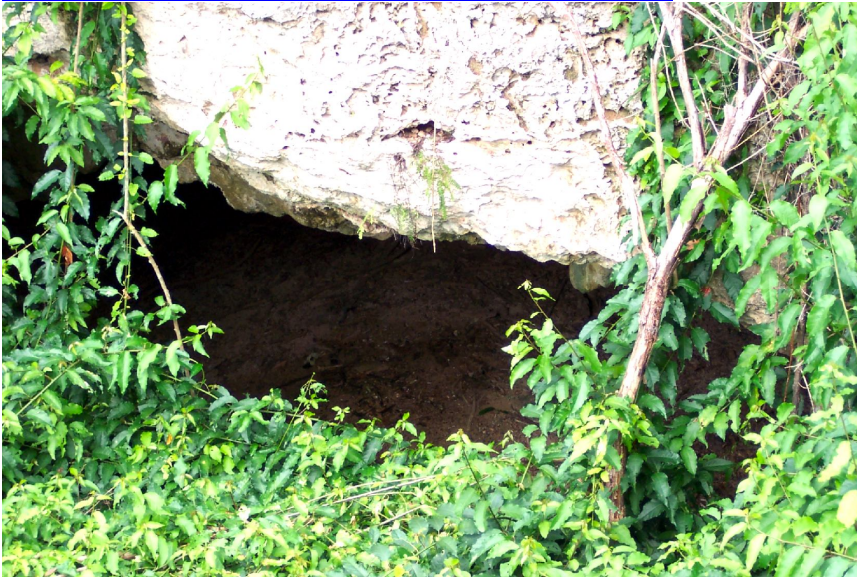
Appendix III: Figures 35 and 36 - The cave with collapsed roof and rock shelters