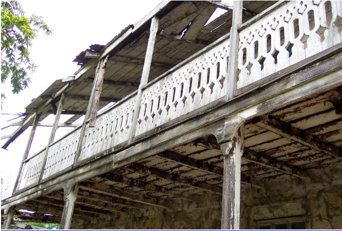
Appendix III: Figure 8 –The ornate balustrades on the second floor verandah