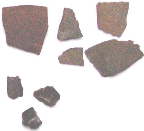
Figure 3: Top left – Iron cooking pot shard; Top right –four roofing slate shards; Bottom – green wine bottle shards: late 18th century.