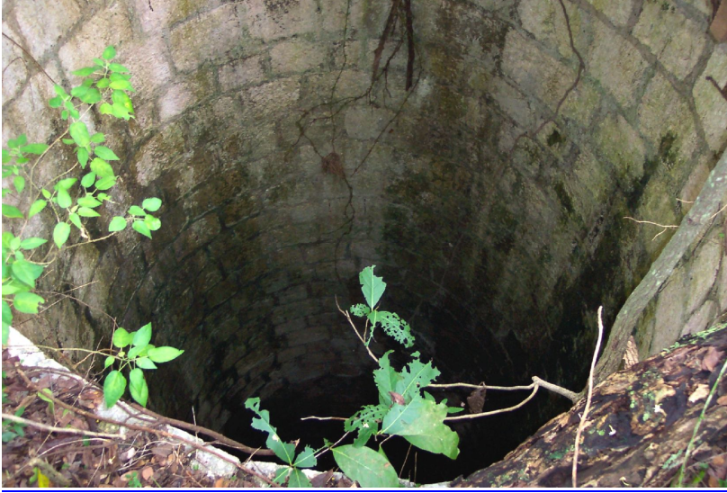
Appendix III: Figure 21 - Well to the north of the planter's house