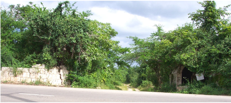
Appendix III: Figure 16 – The entrance to the property