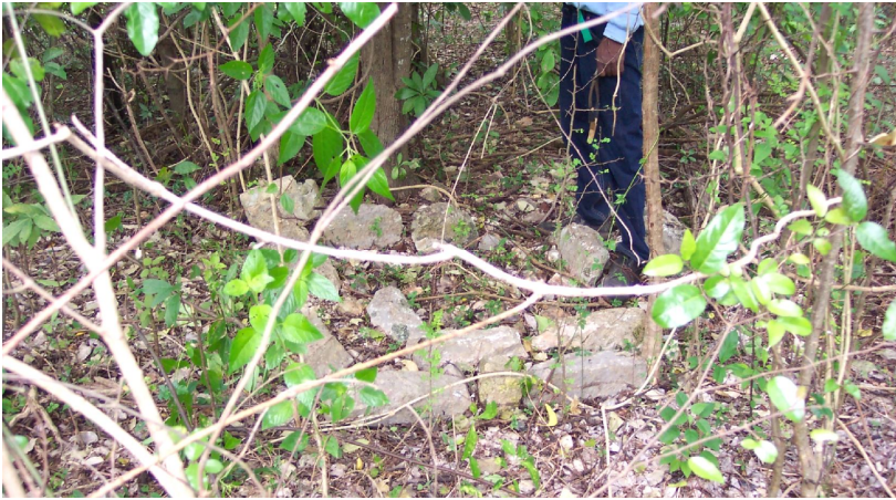
Appendix III: Figures 27 – A small grave within the cattle complex.