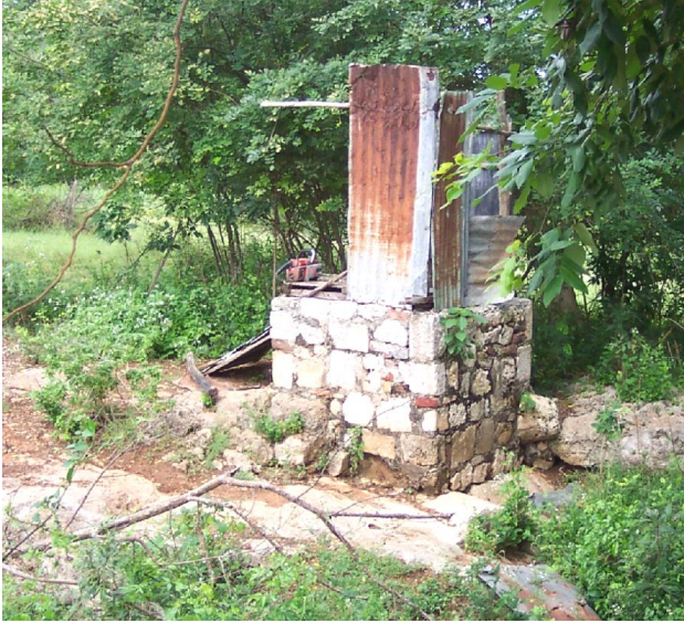
Appendix III: Figure 30 – The farm houses outside latrine