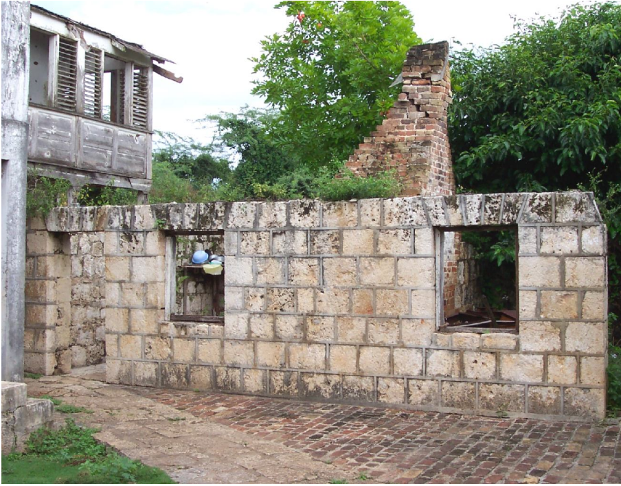
Appendix III: Figure 12 - The kitchen with a chimney and an attached dining room to the right.