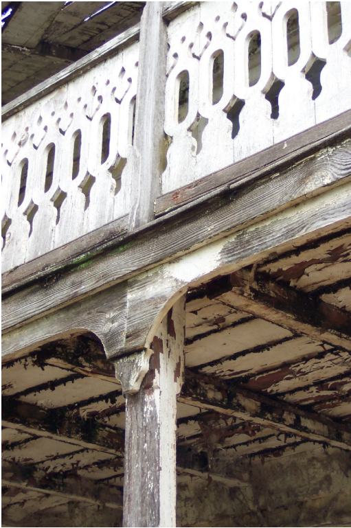
Appendix III: Figure 7 – The columns on the Planter’s house heads and the ornate balustrades on the second floor verandah