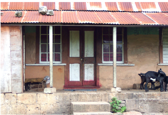
Appendix III: Figure 29 – The overseer's or farm house