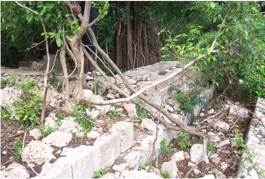
Appendix III: Figure 22 – Catchment tank and a cattle watering trough that it feeds