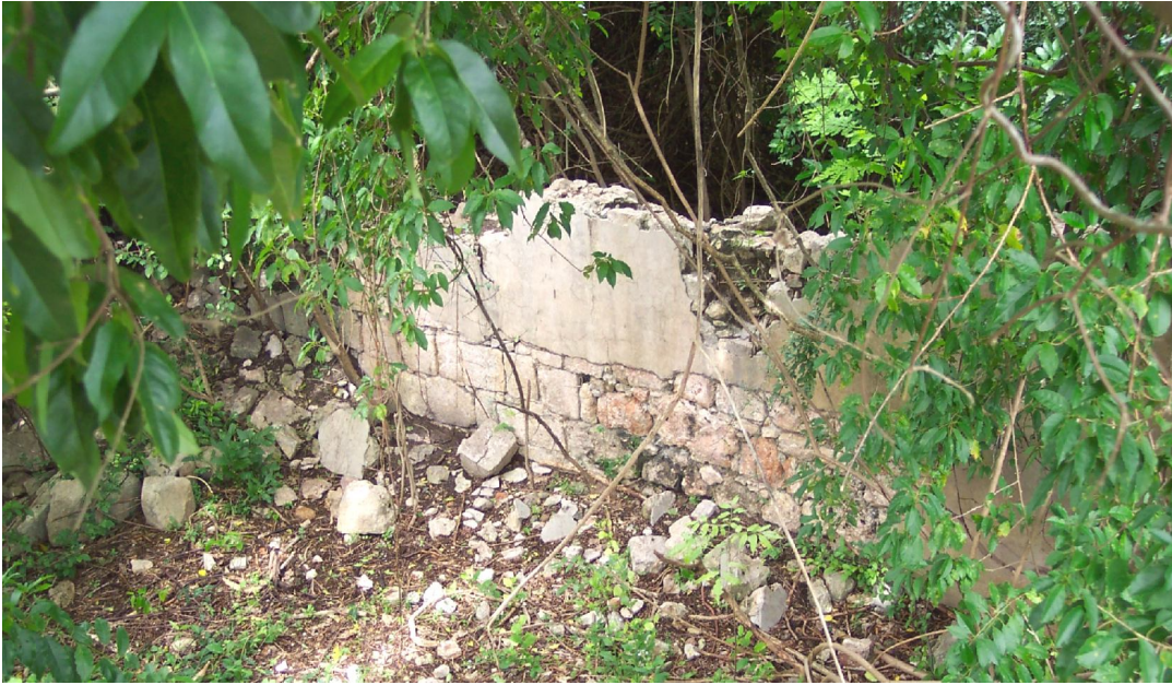
Appendix III: Figure 23 - Water catchment tank