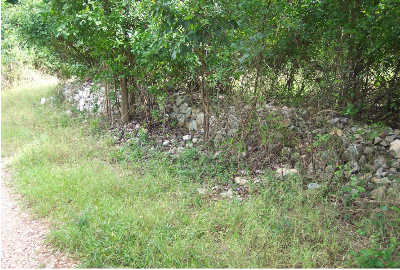
Appendix III: Figure 20 – Packed wall property fence on the southern side of the property road