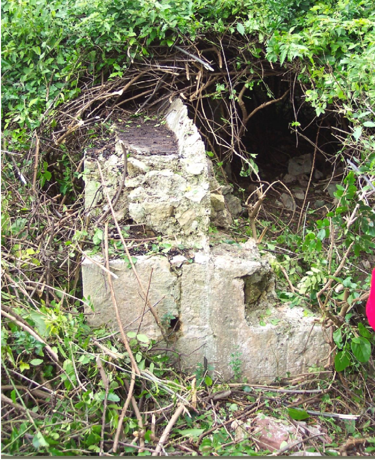
Appendix III: Figure 24 - Cutstone aqueduct that fills the Catchment tank