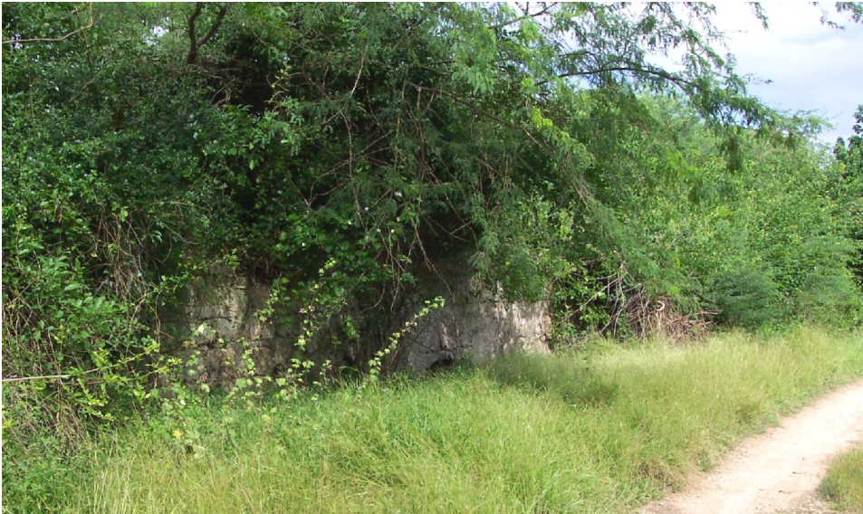
Appendix III: Figure 19 - Cattle or horse pen walls made from cutstone on the northern side of the property road