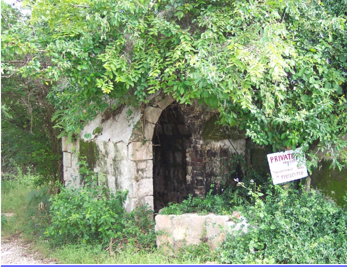
Appendix III: Figure 15 - The guard house at the entrance to the property leading to the house