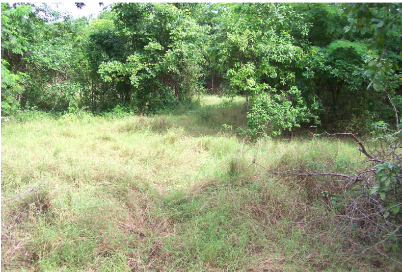
Appendix III: Figures 33 and 34 - Calabash trees in thick grass connected with small grave sized and shaped grooves