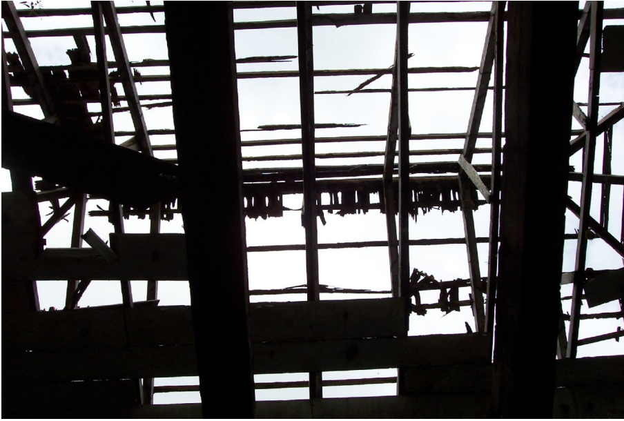
Appendix III: Figure 10 - The roof of the planter's house