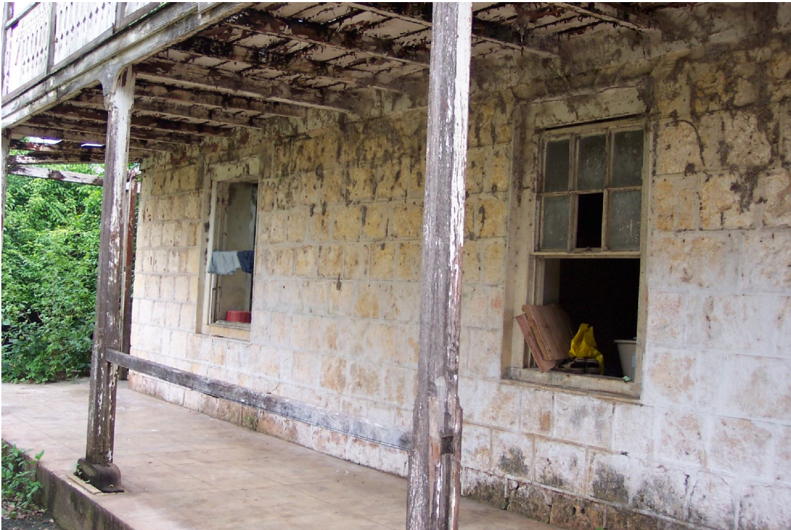
Appendix III: Figure 9 –Cutstone walls of the ground floor of the planter's house showing the wood columns and sash windows