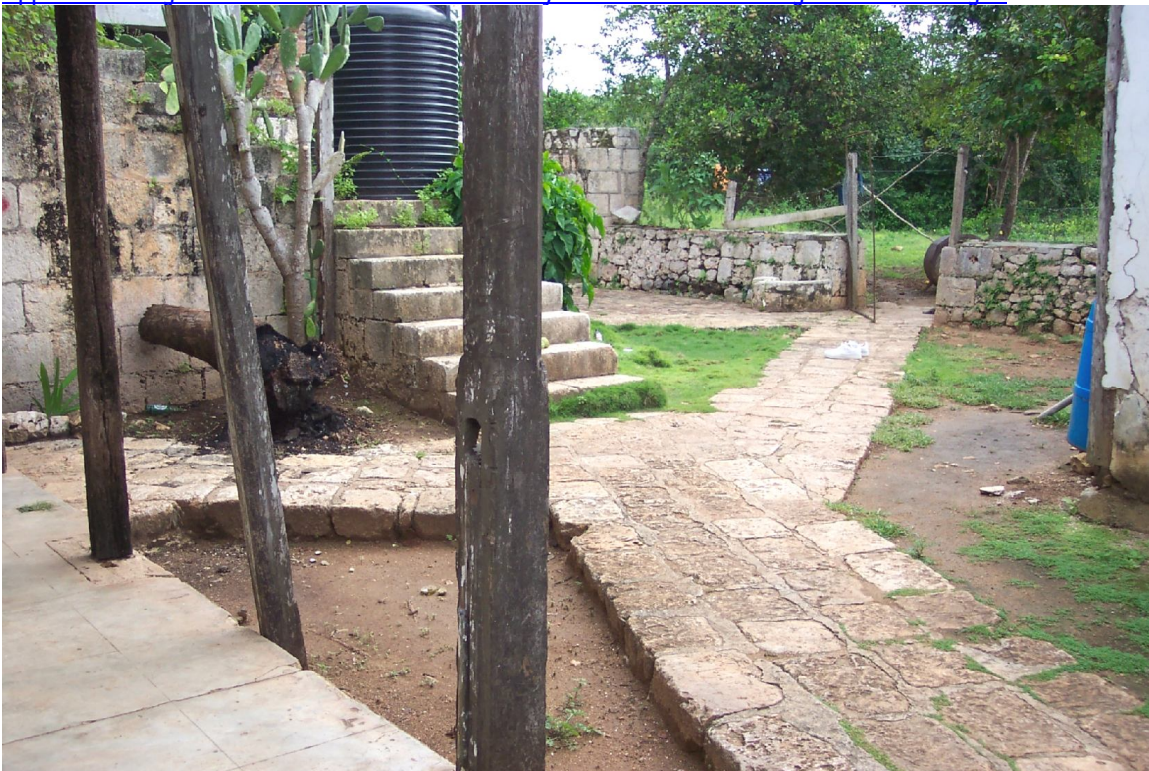
Appendix III: Figure 13 - The back of the house with cutstone walkways connecting the entrance through the fence, the kitchen and an outside store room to the main house