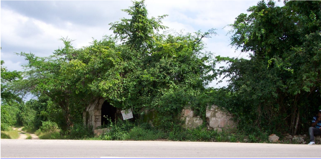
Appendix III Figure 18 – The wall from the entrance south along the main road