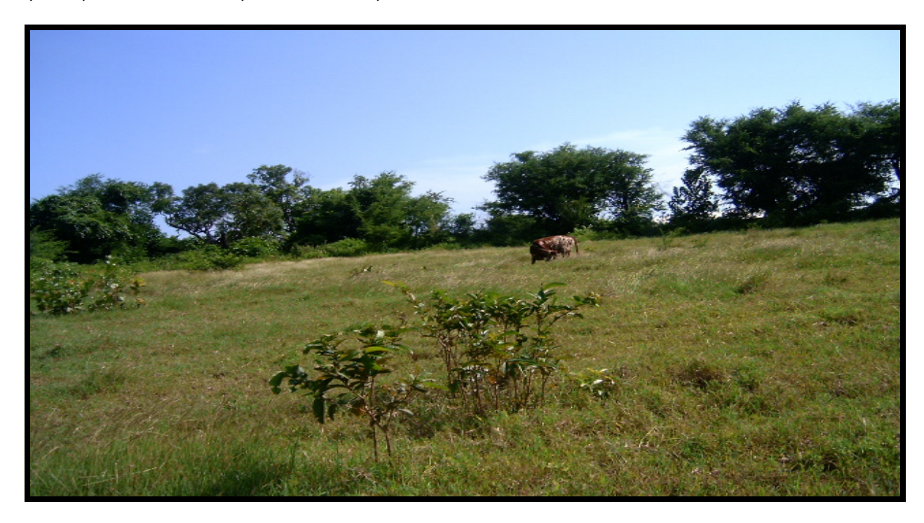
Plate 10: Cow grazing at the site of the proposed West Palm Memorial Gardens

The property is zoned by the Westmoreland Development Order 1978 (amended in 1991) for agriculture, while the Savanna-la-mar Development Plan (1998) developed by the Town Planning Department recommended that it be used for commercial activities or public buildings. However, the dominant land use presently on the property is open space/agriculture (informal cattle grazing). The adjacent land uses are institutional (south), commercial (west), cemetery (south) and residential (north and east).