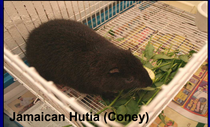
Jamaican Hutia (Coney)