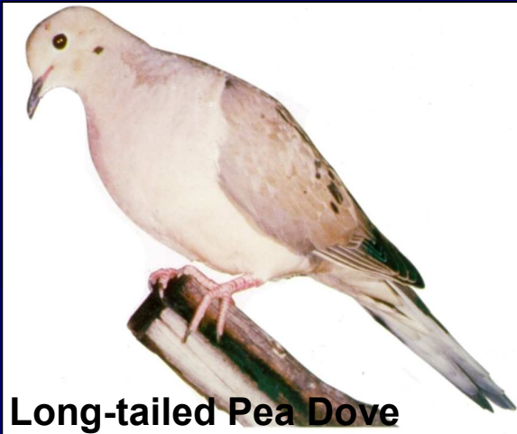
Long-tailed Pea Dove