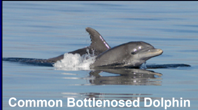
Common Bottlenosed Dolphin