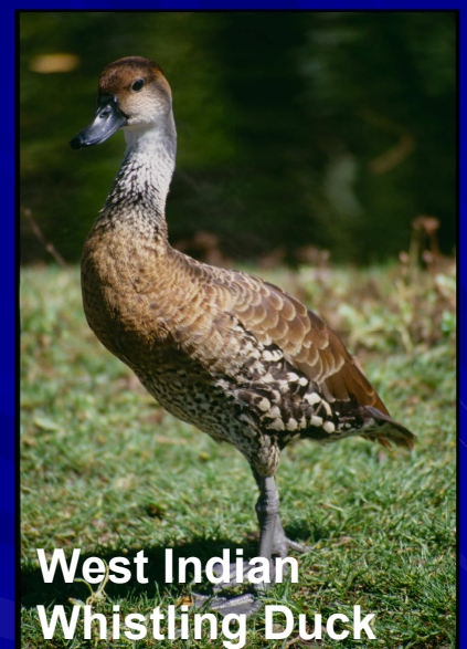
West Indian Whistling Duck