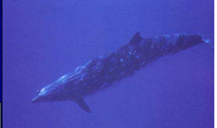
Baird's beaked Whale