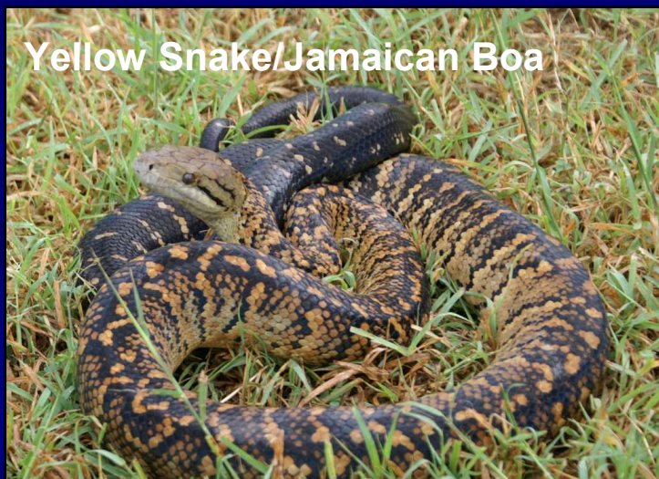
Yellow Snake/Jamaican Boa