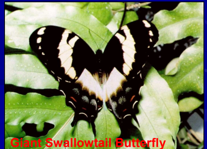
Giant Swallowtail Butterfly