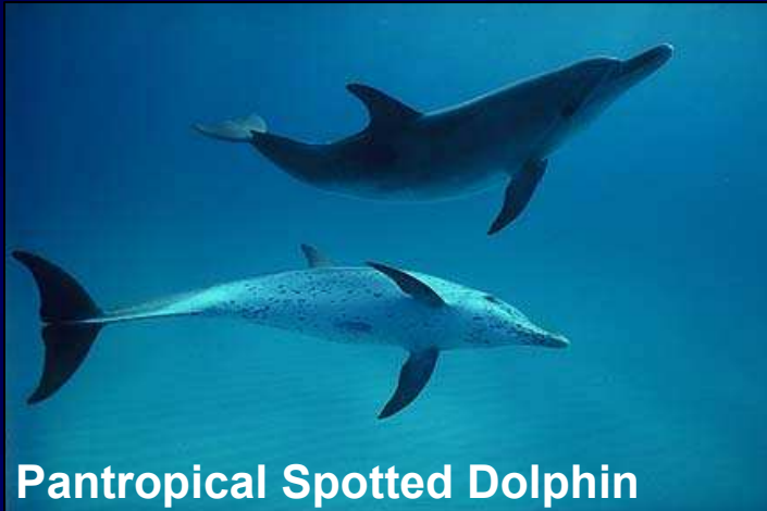
Pantropical Spotted Dolphin