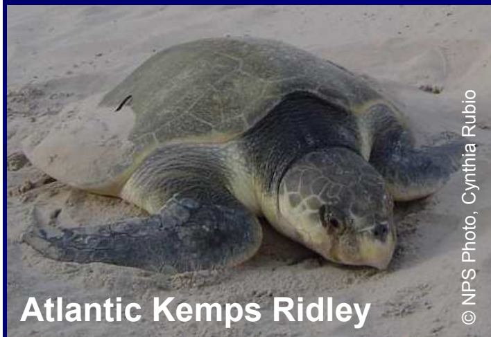
Atlantic Kemp's Ridley