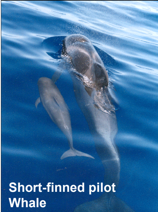
Short-finned pilot Whale