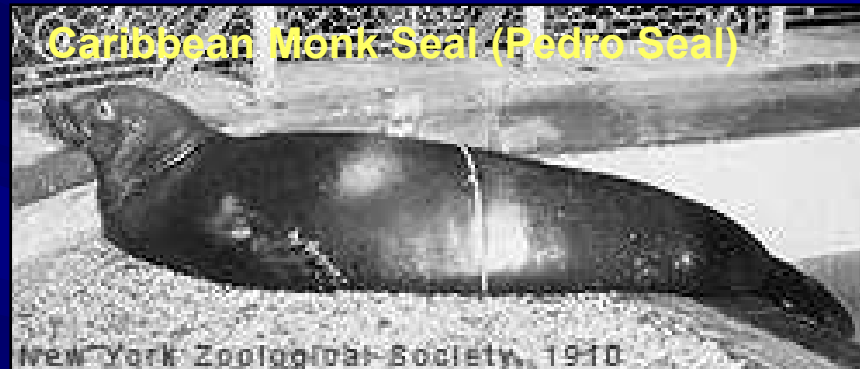
Caribbean Monk Seal (Pedro Seal)