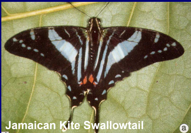
Jamaican Kite Swallowtail