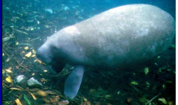
West Indian Manatee