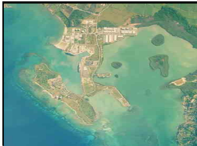
View of Montego Bay Marine Park