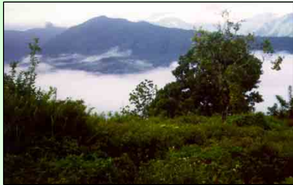
View of National Park at Blue and John Crow Mountains

In collaboration with private and public sector groups, create and maintain a system of protected areas which is managed for the benefit of the public