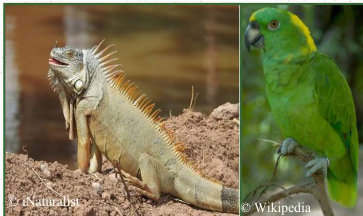
Figure 5: The invasive Green iguana and Yellow-naped parrot.