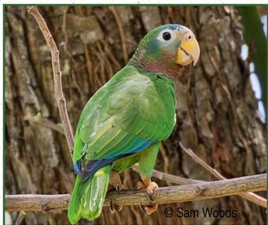
Figure 2: The threatened and endemic Yellow-billed parrot

The capture of wildlife not only impacts the species involved but also their associated habitats. This can result in decimation of the local wildlife populations and cause serious and lasting harm to their habitats. Many species have become endangered or even threatened with extinction as a result of this, for example the Yellow-billed parrot ( Amazona collaria ) (Figure 2).