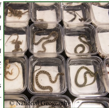
Figure 3: Transporting reptiles to be sold as pets.

The transportation of exotic animals is also considered a stressful process for the captured animals and may also result in the death of some individuals. These animals are shipped via containers, including boxes, bags, buckets,