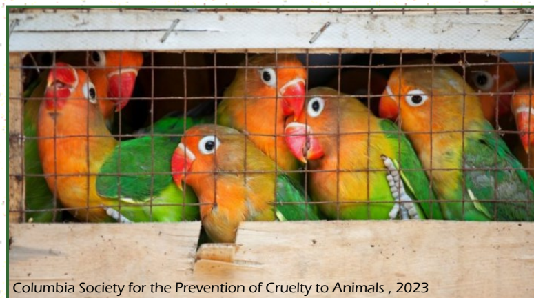
Columbia Society for the Prevention of Cruelty to Animals , 2023

The wildlife trade involves thousands of species and exotic animals such as parrots, lizards, snakes and fish which are being caught, bred and shipped around the world. Some of which are destined for the pet trade here in Jamaica. Others will merely pass through the island's borders on their way to being sold as pets in other countries (The British Columbia Society for the Prevention of Cruelty to Animals , 2023).